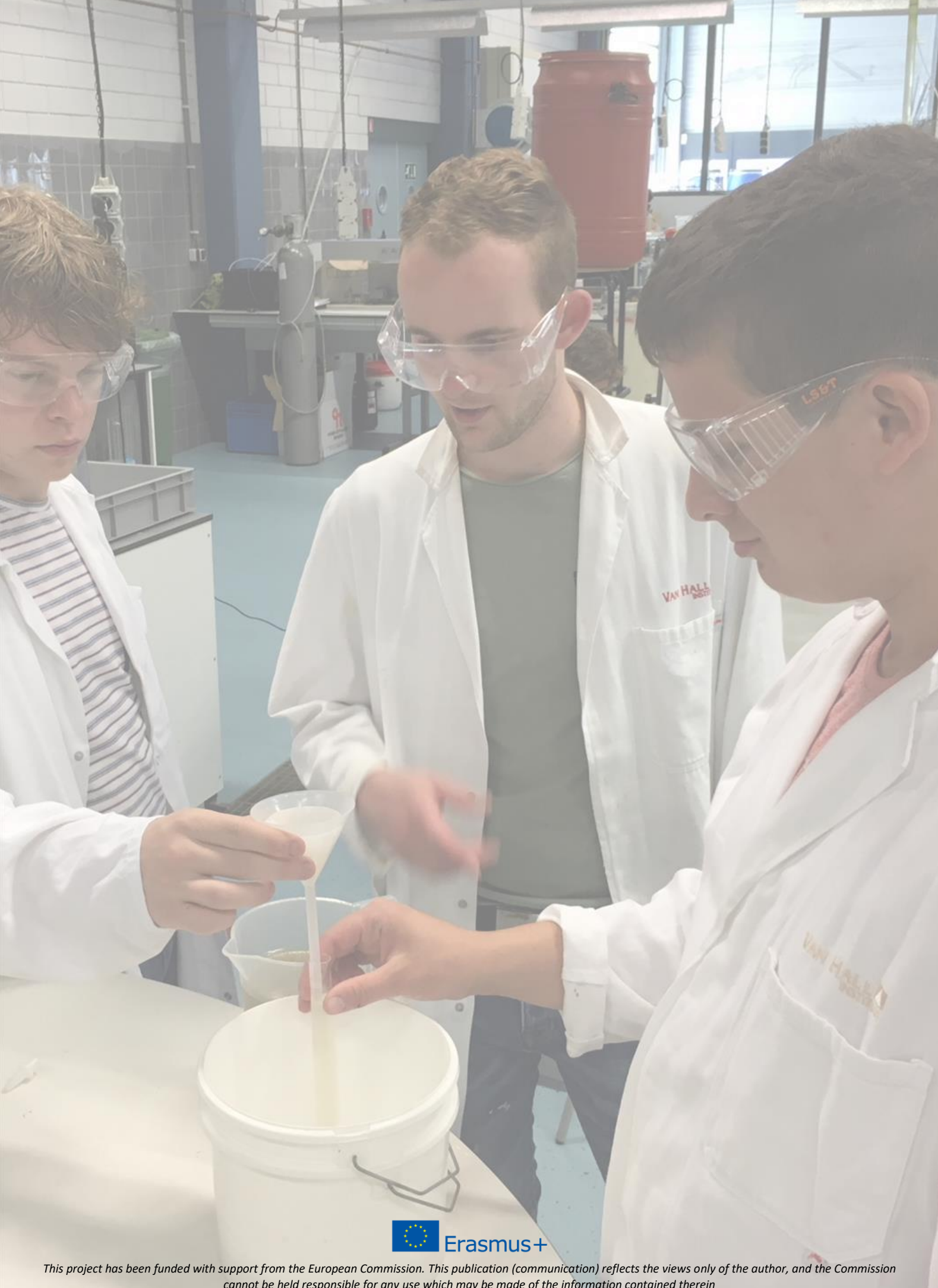
cannot be held responsible for any use which may be made of the information contained therein